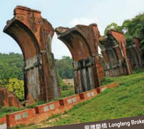
龍騰斷橋 Longtang Broken Bridge