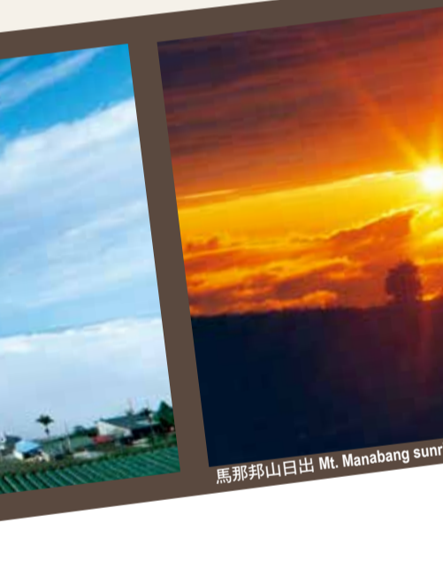
馬那邦山日出 Mt. Manabang sunrise