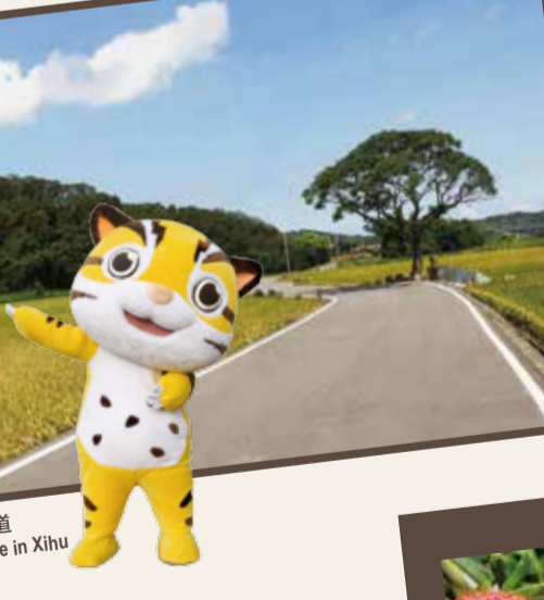
西湖伯朗大道 Brown Avenue in Xihu