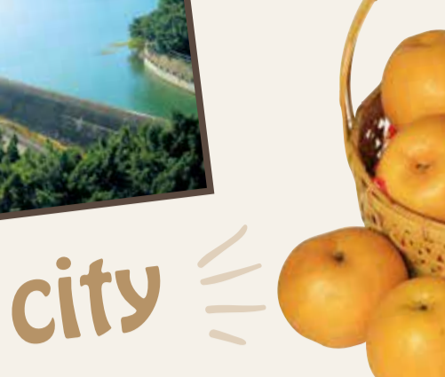
三灣梨 Sanwan pears