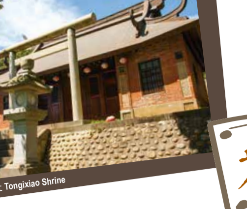
通霄神社 Tongxiao Shrine