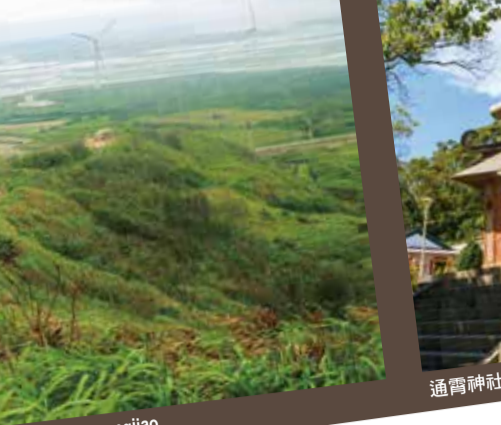
通霄神社 Tongxiao Shrine