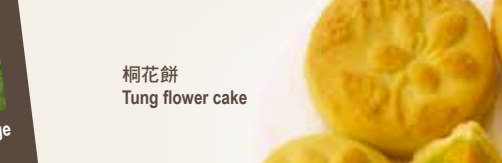
桐花餅 Tung flower cake