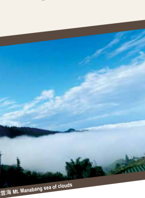
馬那邦山日出 Mt. Manabang sea of clouds