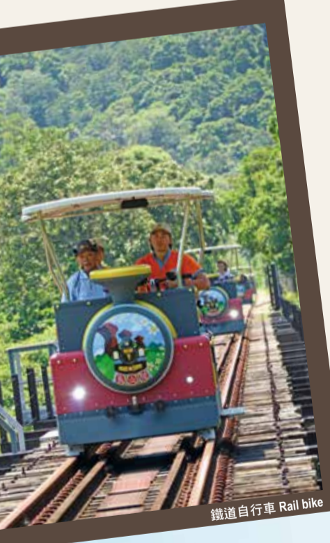
鐵道自行車 Rail bike