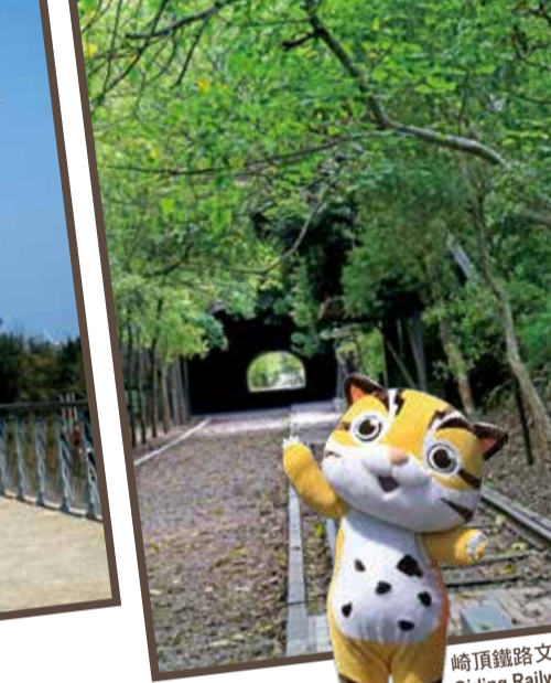
崎頂鐵路文化園區 Qiding Railway Museum